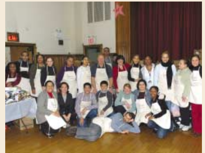
"Rusty" Staub and Catholic Charities staff take a break from distributing hundreds of holiday meals in Harlem

Catholic Charities is fortunate to have professional staff who "go the extra mile" as the norm.