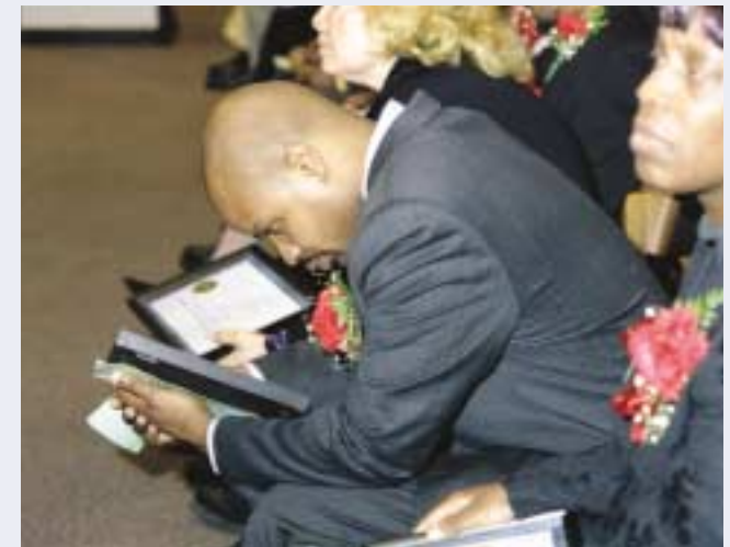
A graduate of the Educational Outreach Program, Social and Community Development

Respond to 75,000 hotline calls from teens and other individuals in crisis