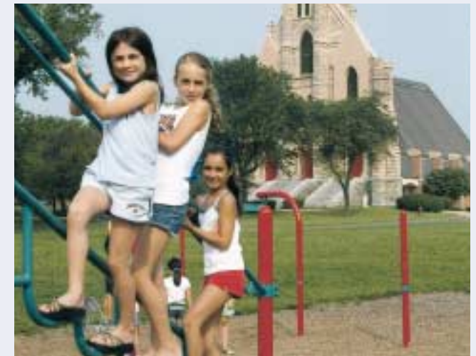
Children enjoy camp, MIV on Staten Island

“MIV at Mount Loretto and CYO are crafting a strategic plan to respond to new and growing needs on Staten Island”