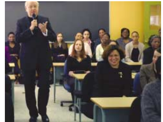
Cardinal Egan visits a class at Grace Institute

“For more than a century, Grace Institute has provided tuition-free, practical job training for underserved women...”