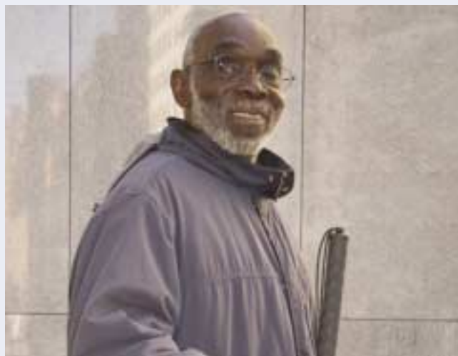
Visually challenged are helped by the Guild for the Blind